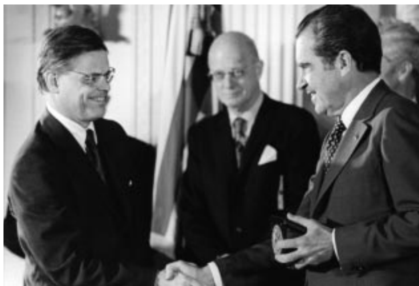
Wilson receives the Medal of Science from President Nixon in 1973.

After World War II, Wilson became a professor of physics at Cornell University. For the next 20 years, he worked at building larger and larger particle accelerators there, leading up to his appointment as director for the National Accelerator Laboratory. He was a member of the American Physical Society, the National Academy of Sciences, the American Academy of Arts and Sciences, and the American Philosophical Society. He was the author