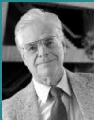
Robert Rathbun Wilson 1914 ~ 2000