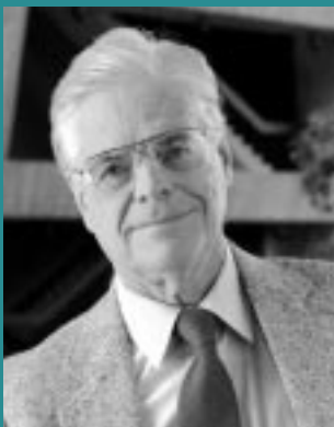
Robert Rathbun Wilson 1914 ~ 2000

COVER: Robert Rathbun Wilson, Fermilab's founding director, wielding a shovel at the groundbreaking for the Main Ring in 1969.