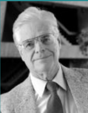
Robert Rathbun Wilson 1914 ~ 2000