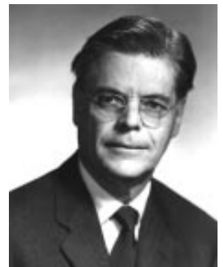
Robert Wilson in 1971.

R obert Rathbun Wilson, a Wyoming cowboy who built the world's highest-energy particle accelerator laboratory with the eye of an artist, the shrewdness of a banker and the conscience of a human rights activist, died late on Sunday night, January 16, 2000, at a retirement home in Ithaca, New York, near Cornell University, after a long illness. He was 85.