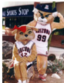
Wilma and Wilbur Wildcat

SCHOOL COLORS: Cardinal red and navy blue